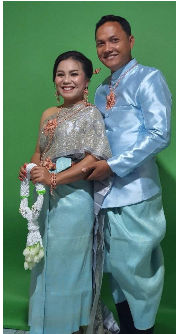
This photo from the studio will be used at their wedding.

It has been so good to get back in Cambodia, see old friends , see the graduates and see how much Poipet has grown! Yesterday I saw a lot of development in some areas but there are still lots of overwhelming needs. I feel for the poor people and the kids. I'm thankful our MMF School is still up and running. Please keep us in your prayers.