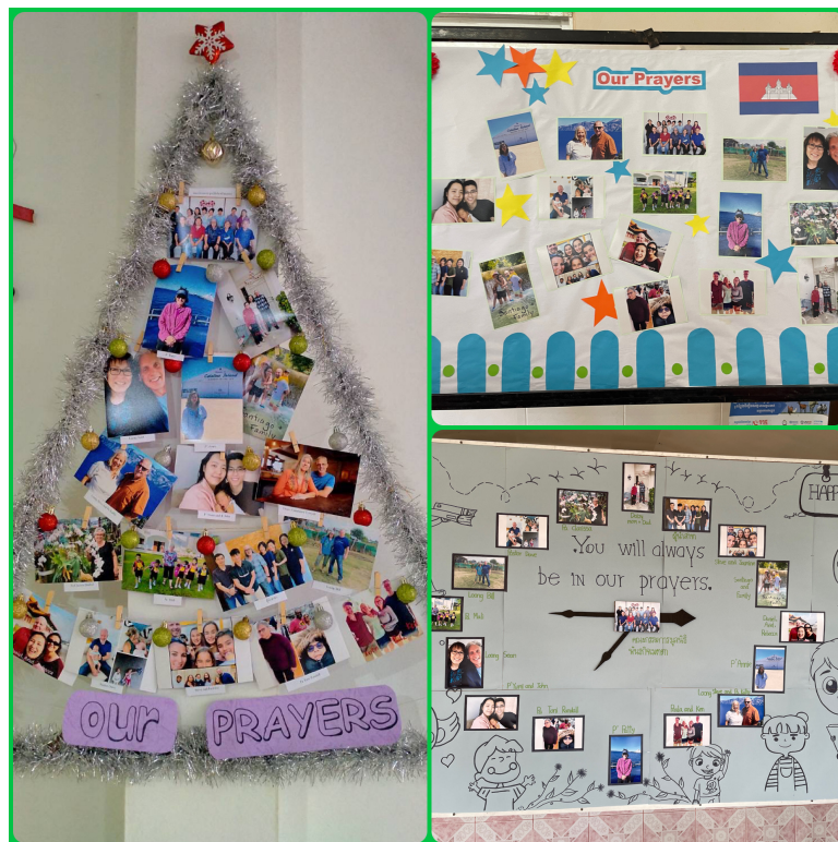
The kids homemade prayer boards from Chiangsaen , Chiangrai and the Poipet Home.

For donations : Mercy Force International PO Box 230505.Encinitas, Ca 92023-0505 USA (Check payable to : Christian Happy Home)